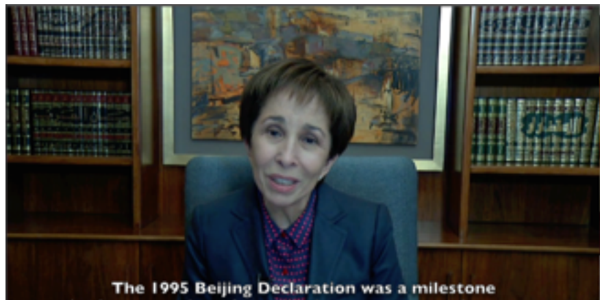
in the promotion of equality between men and women.

UN Women Jordan Country office will broadcast a video message by HRH Princess Basma bint Talal (UN Women Goodwill Ambassador) who speak to women across the Arab countries on this occasion to encourage them for further achievements a n d to a d d r e s s y o u t h, encouraging them to join forces and support women rights within their societies.