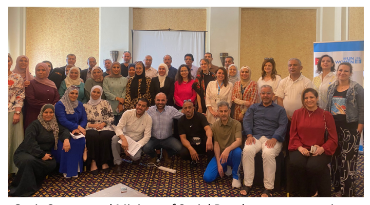
Oasis Centres and Ministry of Social Development strategize at a retreat to further empower Jordanian and refugee women, with funded from the EU Madad Fund.

In an impactful two-day retreat, the 18 Oasis Centres, operating across 11 governorates in Jordan which are funded by EU Trust Fund 'Madad', convened with the Ministry of Social Development (MOSD) to refine and enhance their support programs for vulnerable Jordanian and refugee women.