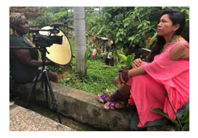
Colombian women filming each other. Quibdó, Colombia.

Across the four research contexts, crisis-affected women expressed a desire to participate not only in meeting their immediate individual and household needs, but also in the design and implementation of humanitarian action and longer-term development and peacebuilding opportunities. Relatedly, and on a more immediate scale, women's active participation in public dialogue emerged as a key indicator of gender-transformative change. Women spoke about gaining the skills and the confidence to engage in