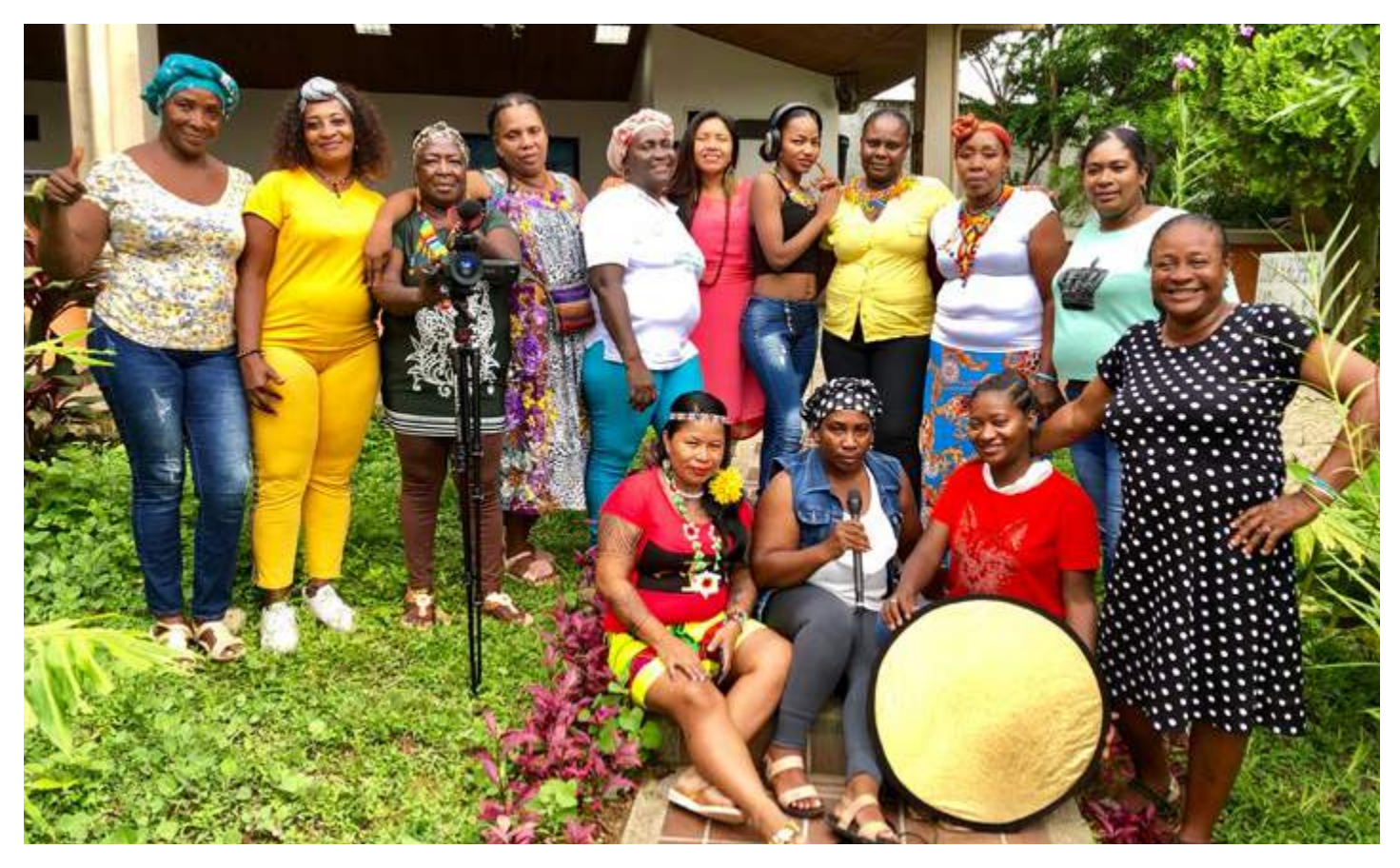
Colombian participants pose for the camera after finishing their participatory video. Quibdó, Colombia