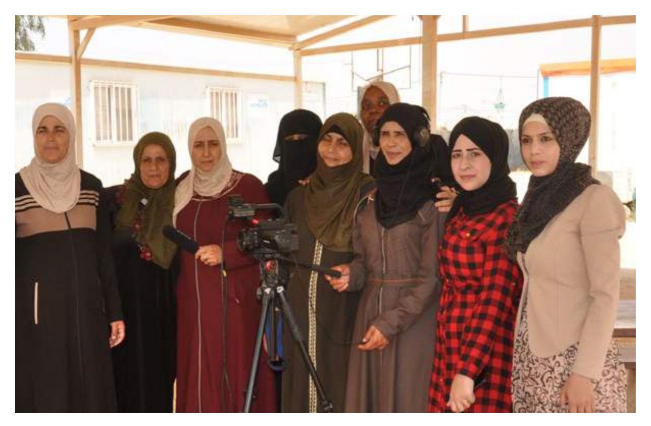
Syrian participants pose for a photo after filming their participatory video. Za'atari Camp, Jordan.

It is not reasonable to expect substantial progress towards gender equality within affected communities if the message sent by humanitarian agencies is that it is appropriate to rely on the unpaid labour of crisis-affected women. Advancing gender equality requires adequate and earmarked resources for grass-roots women's organizations and local leaders to fulfil the expectations placed upon them.