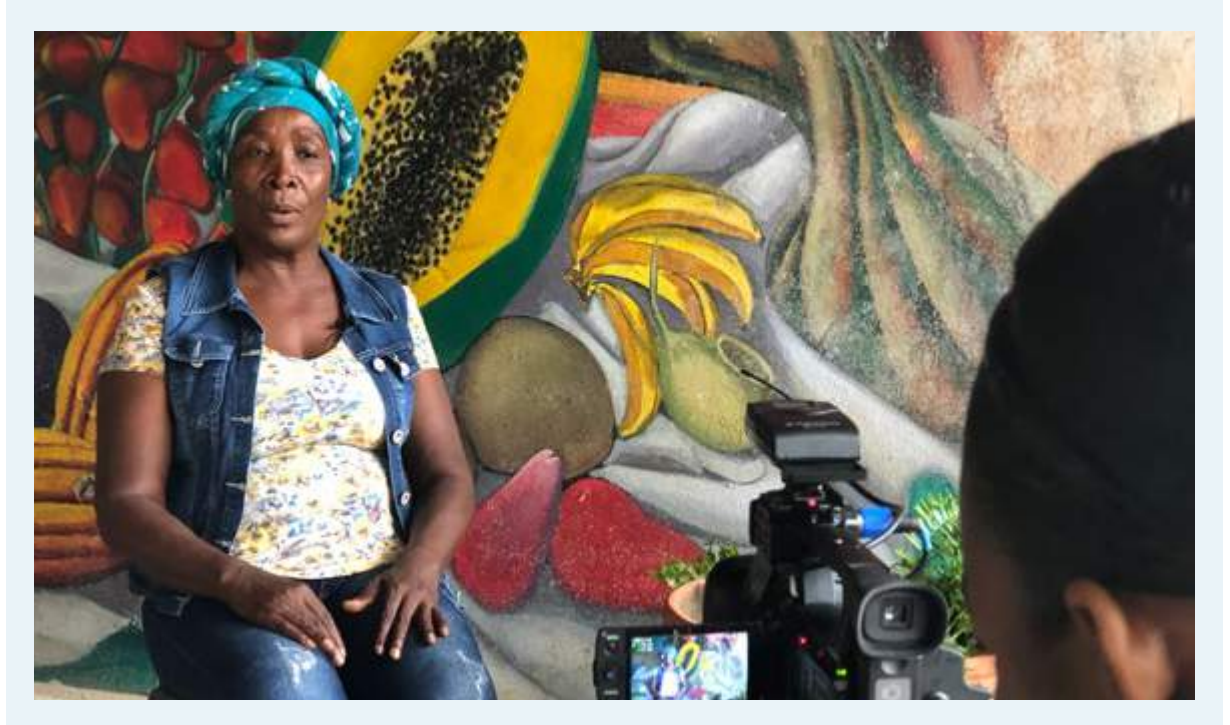
A Colombian leader being filmed by a colleague. Quibdó, Colombia

At the same time, gender norms that maintain this inequality also impose strict expectations on men and boys, centring on their assumed responsibilities for household provision or protection and showing strengths or hiding feelings, which can get in the way of building healthy relationships and often lead men and boys to high-risk behaviours (Plan International 2019).