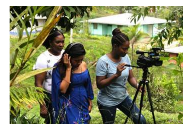
Colombian women filming their participatory video. Quibdó, Colombia.

The research presented in this report is based on a mixed-methods approach that zoomed in on affected populations and includes participatory