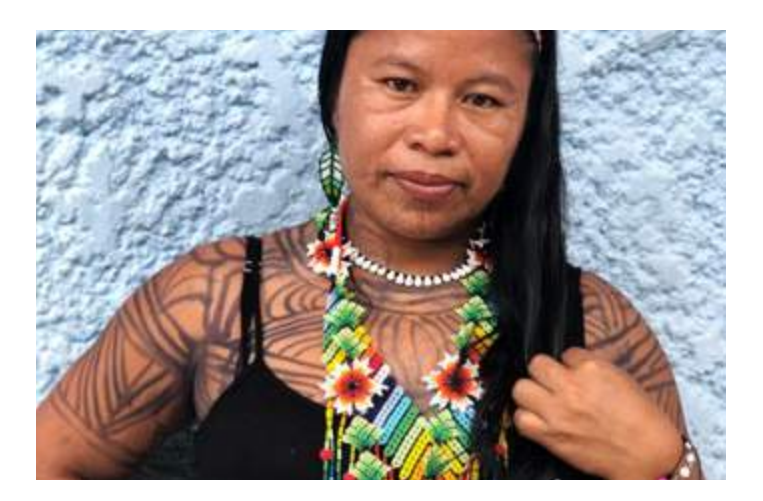
A Colombian woman poses for a portrait. Quibdó, Colombia

assuming new roles and responsibilities, gender norms, as well as notions of idealized femininities and masculinities, are destabilized. Consequently, in humanitarian settings, attitudes towards gender-transformative change depend on power positions at household and community levels and on lived experiences of gendered discrimination and (presumed) privileges of study participants. Different perspectives on gender-transformative change coexist. Positive, mixed and negative attitudes were uncovered in this study.