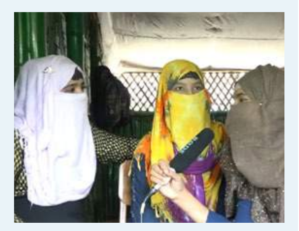
Young Rohingya women interviewing each other for their participatory video. Cox's Bazar, Bangldaesh.

Gender segregation of public spaces can break down during a crisis because of overcrowding and new coping mechanisms that require changes in women and men's roles. An imam in Bangladesh spoke about the changes he had witnessed in his community: "There was no freedom of movement in Myanmar. Now in the camps [youth] are exposed to one another. They are free. Males and females can walk around and that creates problems." (Male, Bangladesh, KII, Connector [imam]) Families may respond to this new "exposure" with measures that may be harmful for young women. "Young boys and girls start interacting, talking, chatting on mobile phones. Then often the families immediately suggest marrying them. That is done primarily to keep their [girls'] reputation, otherwise they would not be able to marry the girl. Also, they would be afraid of the girl being raped." (Female, Bangladesh, KII, Connector [Justice Committee])