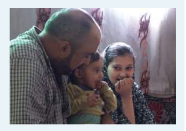
A Syrian refugee family gathers at home. Amman, Jordan.

To be sure, even when men may wish to participate in childcare or domestic tasks, persistent gender norms in the broader community may deter them from doing so. For example, in Jordan, an NGO study participant shared that men have started "taking care of their children, although it shameful for them to be seen doing this" (Female, Jordan, KII, Connector INGO).