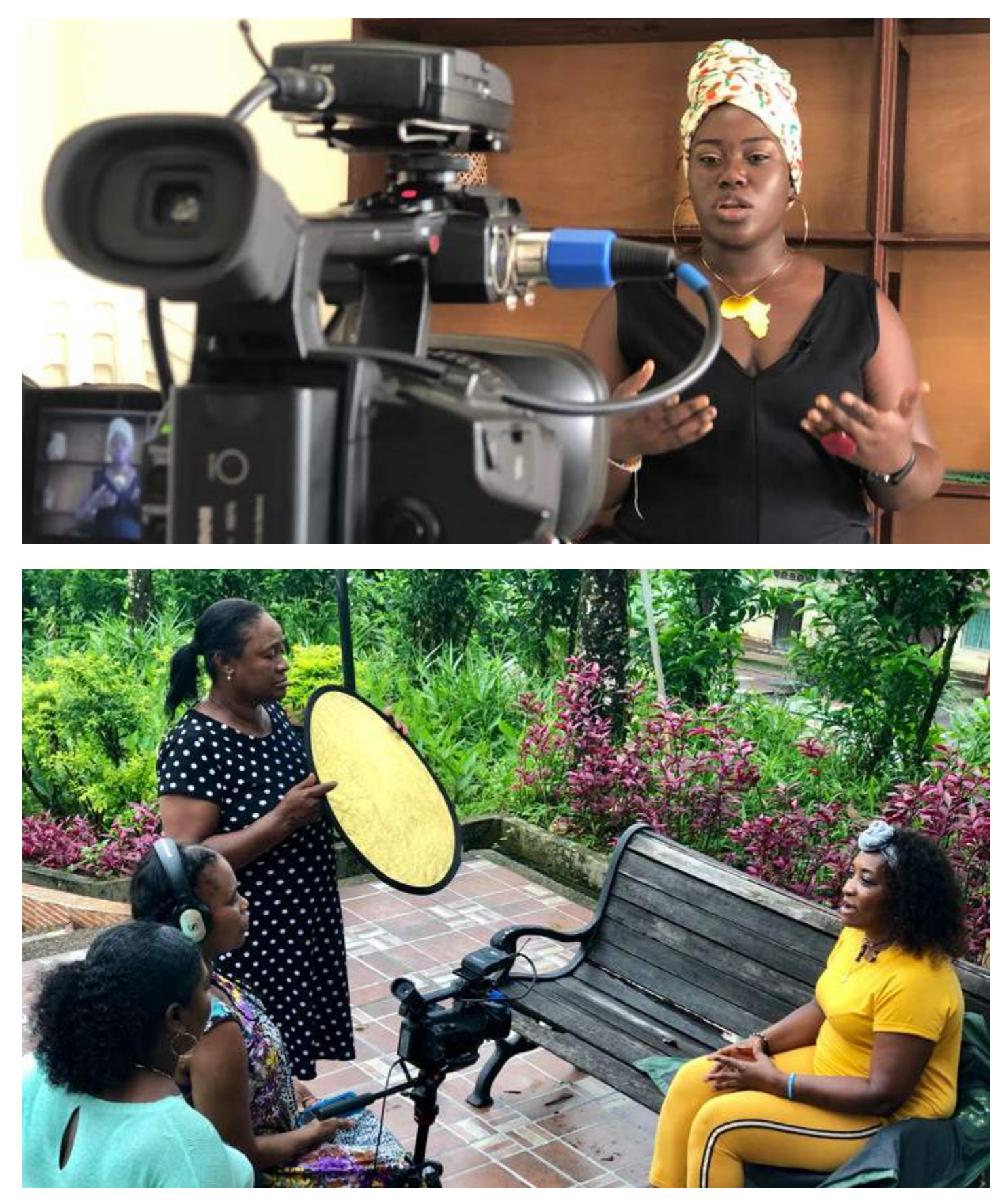
Colombian women during the production of their participatory videos. Quibdó, Colombia.