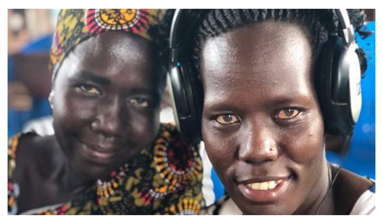
South Sudanese refugee women engage with filming equipment. Bibibidi Settlement, Uganda.

Story 4. Jordan: Community attitudes shift as women earn an income