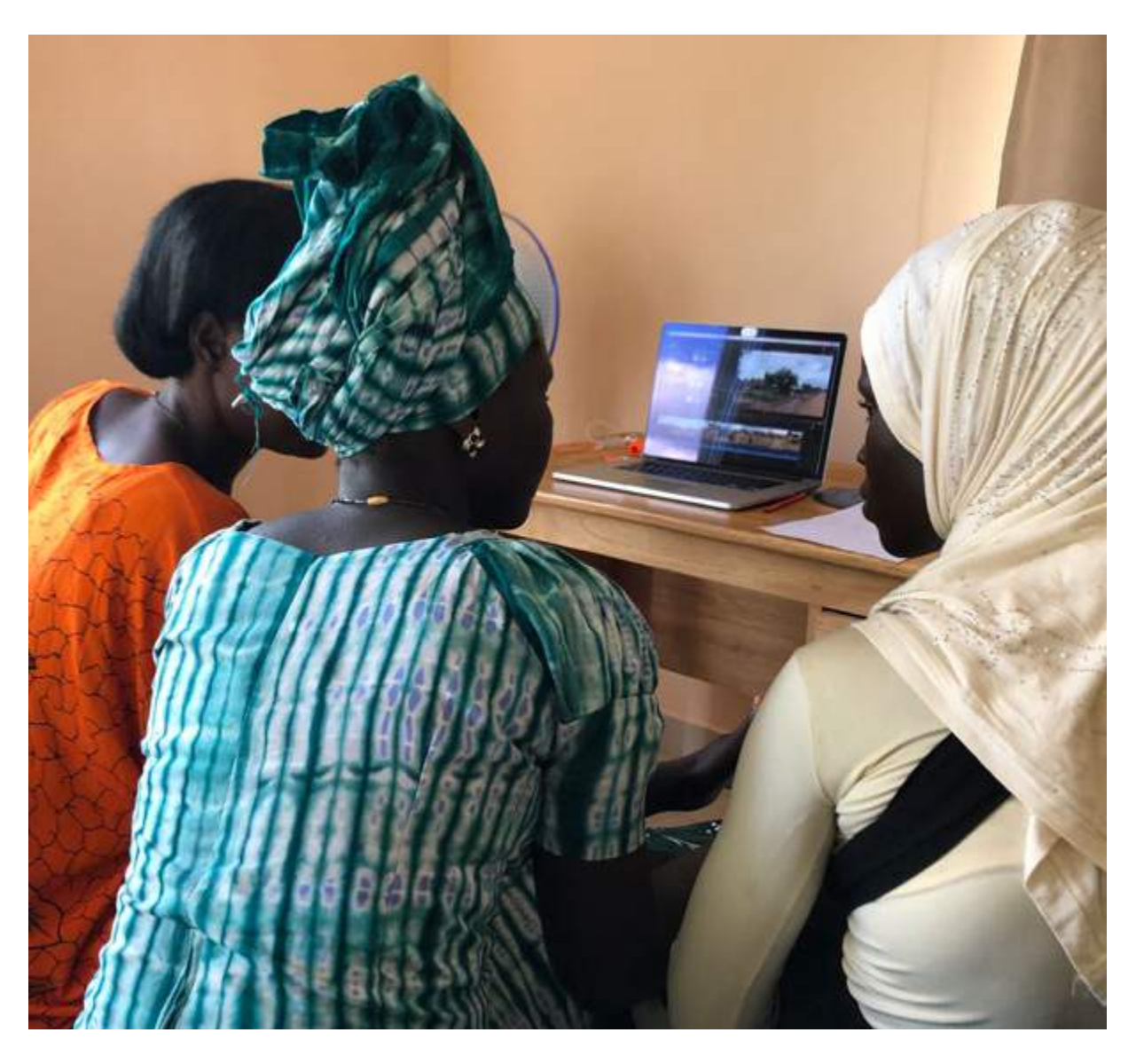
Participants in Uganda during the process of editing their participatory video. Bidibidi Settlement, Uganda.

gender equality. A clear message was that in order for localization to effectively address the needs of women and girls, women's rights organizations need to be approached as capable local actors and funded accordingly.