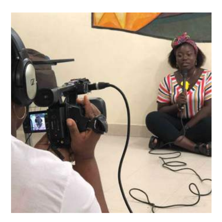
A young Colombian woman holds the microphone while being filmed by a colleague. Quibdó, Colombia

It does this through close examination of two of the Grand Bargain workstreams, both of which have been recognized as high priority for achieving gender equality. The first is the Participation Revolution Workstream, which aims to include recipients of aid in the decision-making processes that affect their lives. The second is the Localization Workstream, which seeks to funnel greater levels of financial and other forms of support to local and national responders. These two areas of work, participation and localization, provide entry points for a gender-transformative approach to humanitarian action and the advancement of gender equality within and beyond emergency contexts. Moreover, the research presented in this report illustrates that gender-transformative humanitarian action can also enhance participation and localization efforts, through, for example, the strengthening