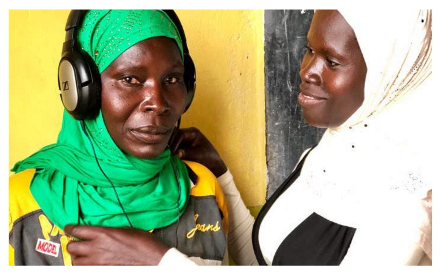
Two women in Uganda help each other with the video equipment. Bidibidi Settlement, Uganda.