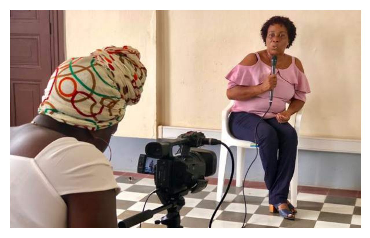
Colombian participants film each other proposing recommendations for humanitarian actors. Quibdó, Colombia

of affected communities is typically sought in formal emergency response programming. Yet we also documented a broader vision of participation held by many of the women in our study, one that involved taking part in meaningful ways in the design and implementation of humanitarian action and of longer-term development and peacebuilding opportunities. This vision reflects the hopes of these women for a durable solution to crisis, one that delivers on a fulfilling future that they have helped to shape.