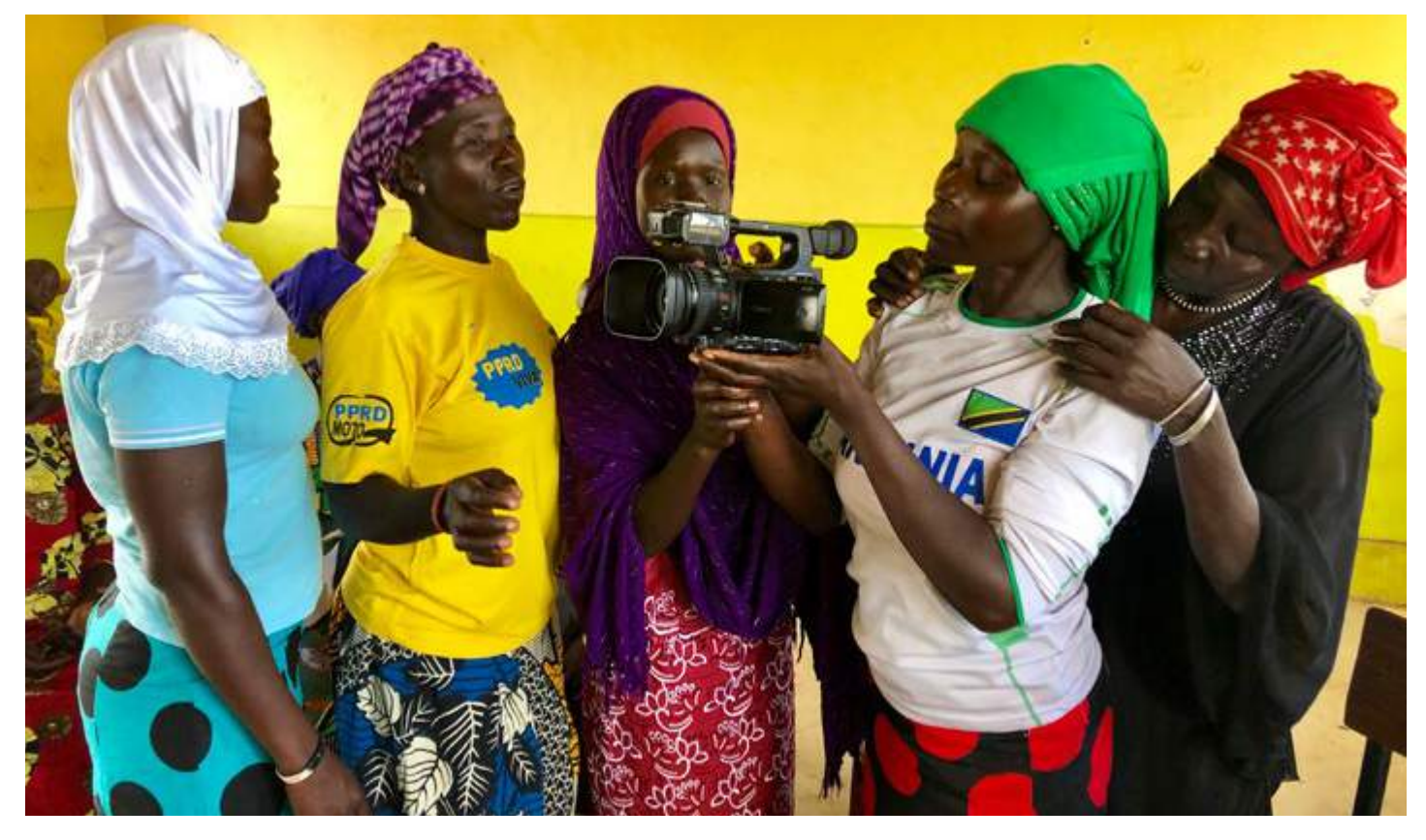
Ugandan host community women exploring the camera equipment together. Bidibidi Settlement, Uganda.