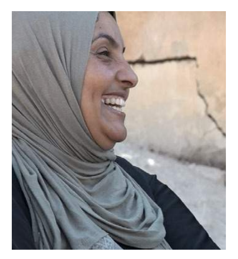
A Syrian refugee woman smiling.

Participants in the study urged international agencies to take measured steps to ensure that localization plans included grass-roots women's rights organizations in addition to national-level actors. Their experiences provide evidence of why the development of partnerships across "local" scales is so important for a more effective humanitarian response.