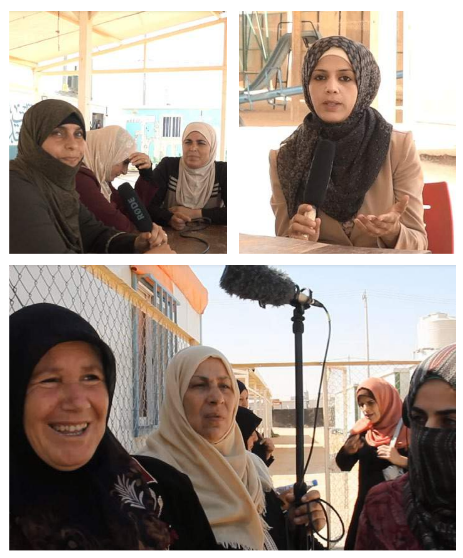
Syrian refugee women filming their participatory videos. Za'atari, Jordan.