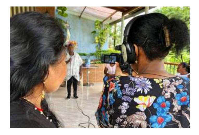
Colombian women practicing the use of video equipment before filming.