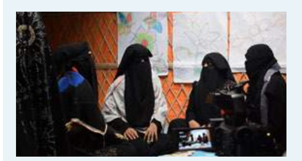
Rohingya participants filming "Shanti Mohila (Peace Women): This is our story" in Cox's Bazar