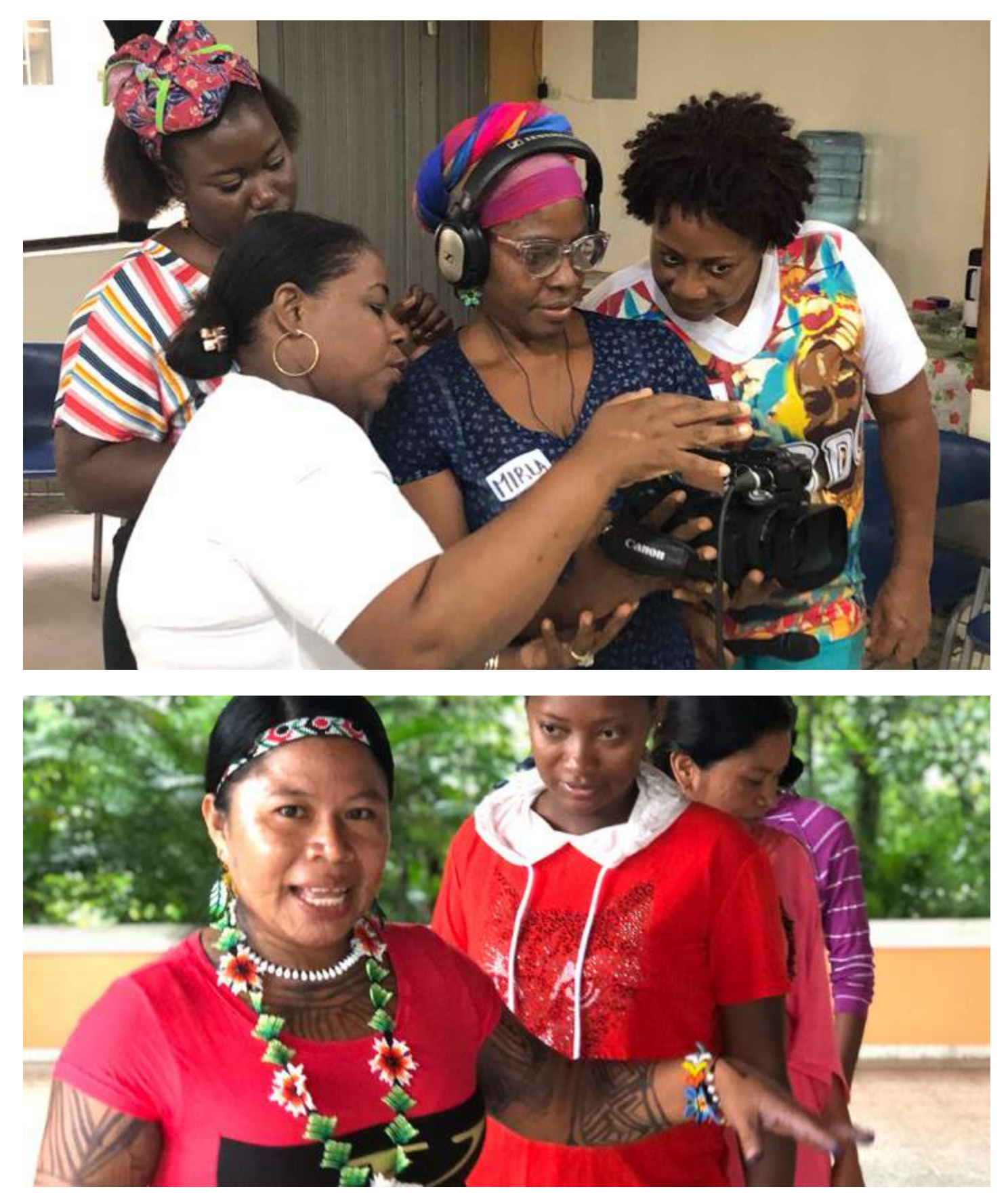
Colombian women during the production of their participatory videos. Quibdó, Colombia.