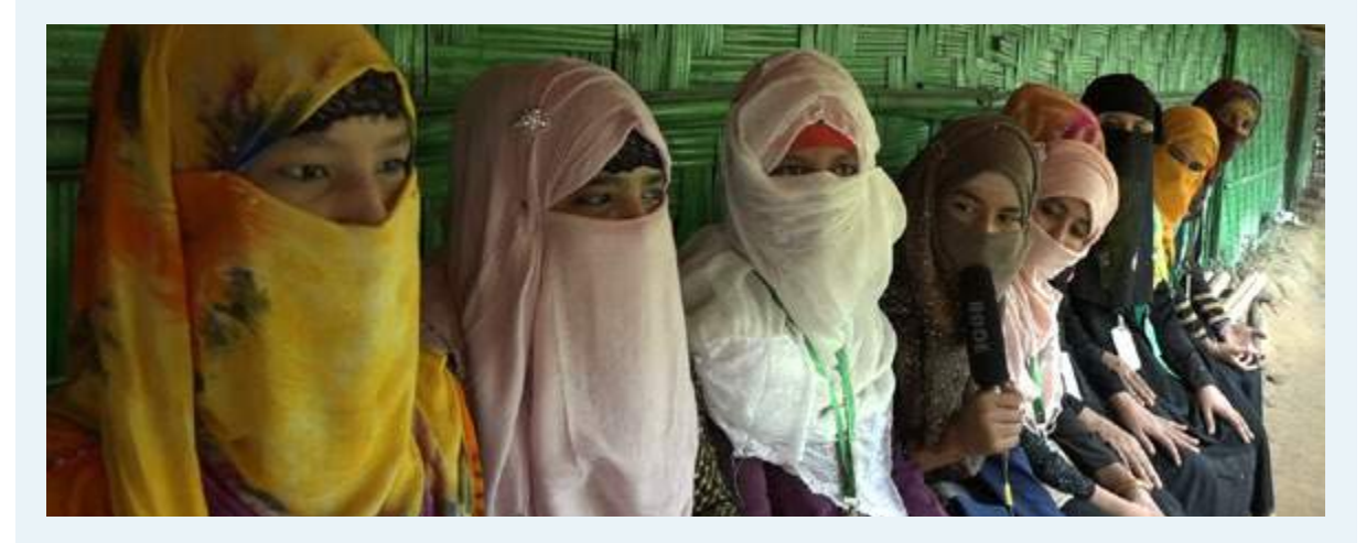
A group of young Rohingya refugee women introduce themselves on camera while filming their participatory video. Cox's Bazar, Bangladesh.

In Bangladesh, Rohingya women find support, solidarity and collective activism in women's groups.