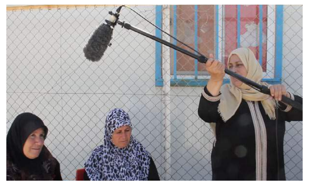
Syrian refugee women filming their participatory videos. Za'atari, Jordan.

and localized humanitarian action. Moreover, it bolsters the potential for humanitarian initiatives to feed into and reinforce development and peacebuilding efforts, offering crisis-affected communities and national duty bearers a more promising future.